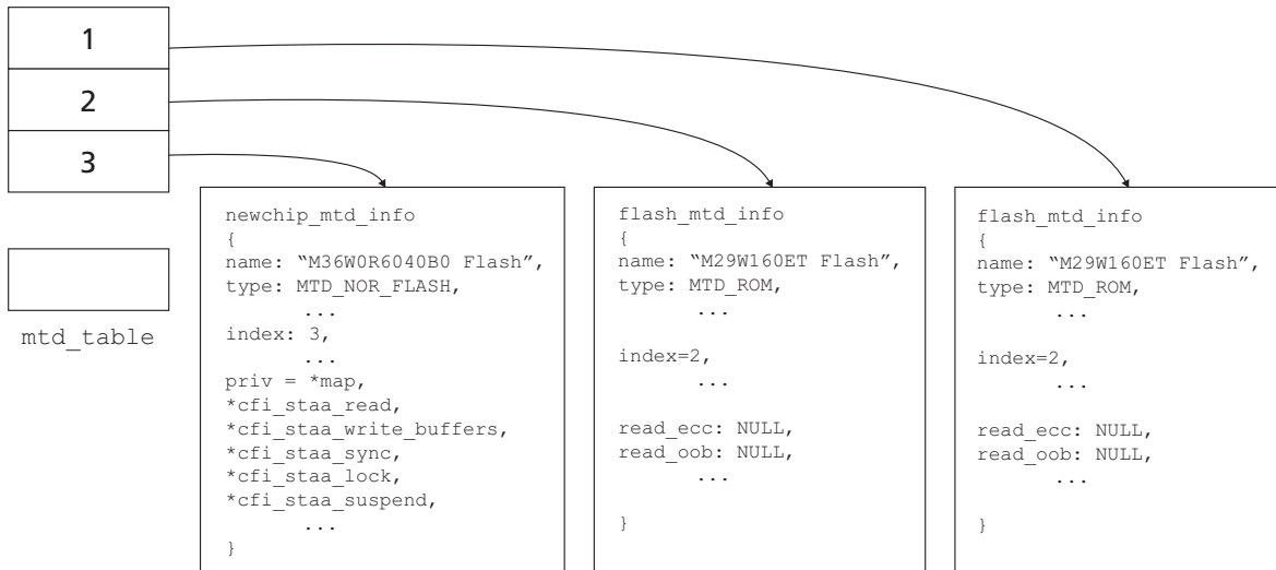
Figure 2: Example of a mtd_info Structure for a New Flash Device Linked to the Table

If a registered device or user is no longer needed, it must be unregistered. del_mtd_device() and unregister_mtd_user() serves this purpose, and runs back through the steps described earlier, until the mtd_table entry is cleared or the notifier's list node is removed.